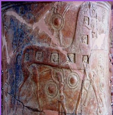
Mykonas vase 675-650 BC