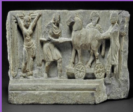
Sculpture from Pakistan AD 100-200