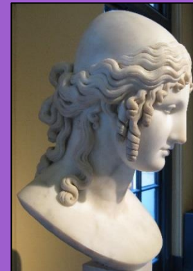
Queen Helen of Sparta