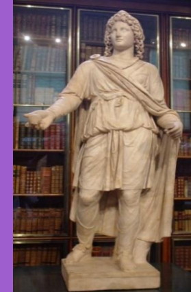
Prince Paris of Troy