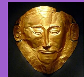
King Agamemnon of Mycenae