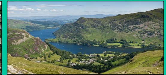
Glenridding in Cumbria