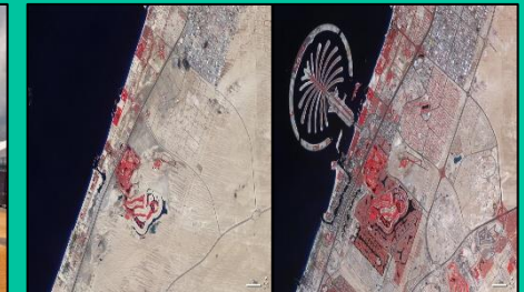
Dubai – development in the last twenty years