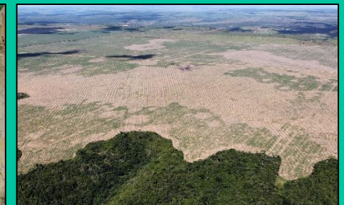
Deforestation in the state of Maranhao, Brazil