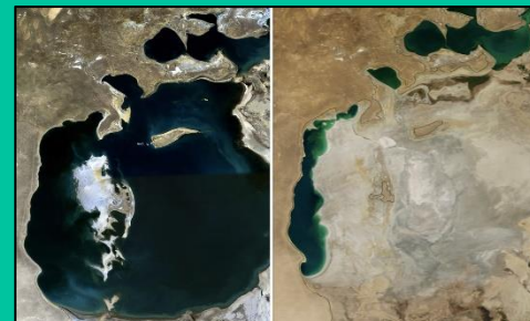
Aral Sea – before and after water extraction for irrigation