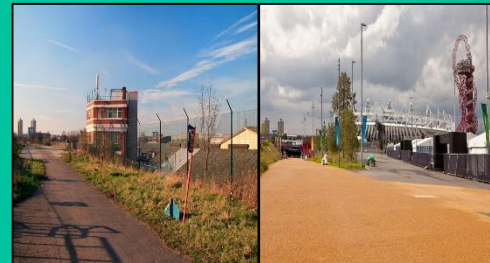
Olympic Stadium and park, London – before and after development