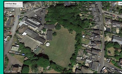
My school grounds and locality