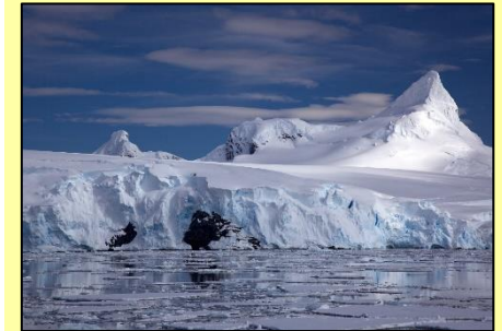
Antarctica and the South Pole