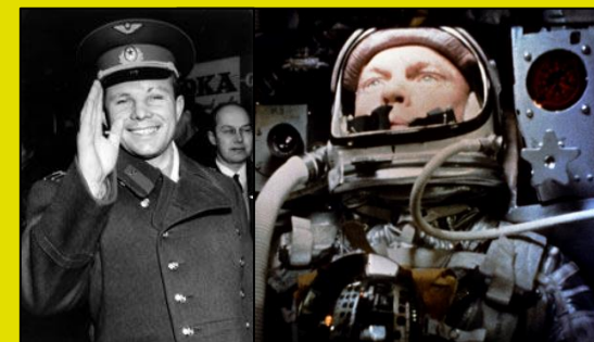
The Space Race in the 1950s and 1960s