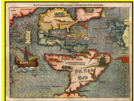
Sebastian Münster's map of the New World, first published in 1540