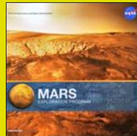
NASA Mars Programme 2020-26