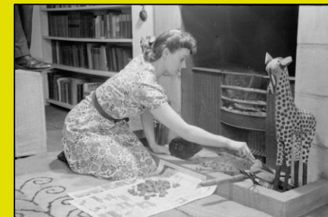
The role of women in Britain in the 1930s