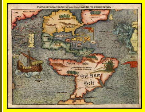
Sebastian Münster's map of the New World, first published in 1540