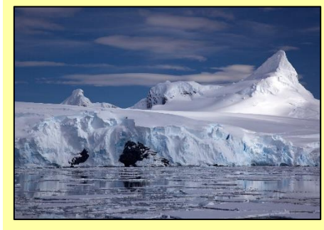
Antarctica and the South Pole