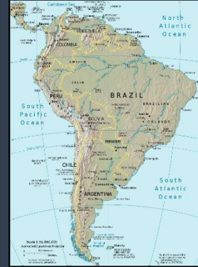
Physical map of South America