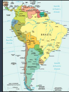
Political map of South America