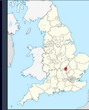
Location of Milton Keynes