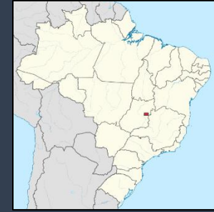
Location of Brasilia