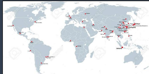
Distribution of the world's megacities