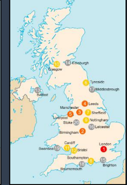
Location of the largest urban areas in the United Kingdom