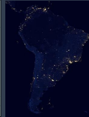
Night satellite image of South America